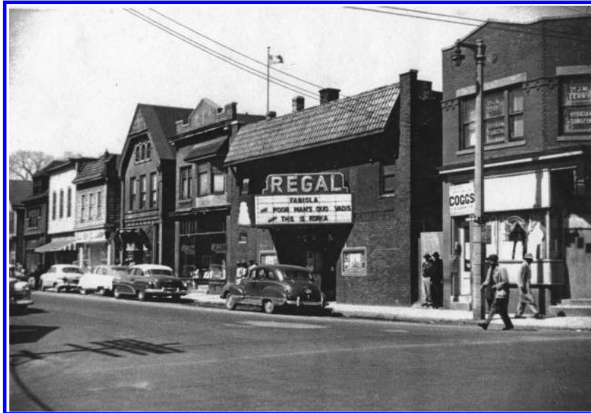
The Regal Theater shown in this image was at the heart of the Milwaukee Black American cultural, social and commercial district, “the original Bronzeville,” near the intersection of Eighth and Walnut Streets. Today, none of the buildings in this photograph are in situ. (Photograph by Archie White, ca. 1950, courtesy of the Wisconsin Black Historical Society Museum Collection)

After a walk to the Milwaukee Art Museum then through the Brady Street District, we wound our way back over the river until we reached Martin Luther King, Jr. Drive, the heart of the newly conceived Bronzeville District where there is a large statue of the late Civil Rights leader. It appeared that some of the planned residential and institutional revitalization was slowly being realized. Information contained on the City’s website indicated that the revitalization process is dependent upon the City’s ability to leverage local assets—ranging from historic, cultural, and architectural resources—into local enterprises and community pride.